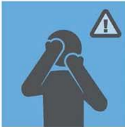
AVOID TOUCHING YOUR EYES, NOSE, OR MOUTH WITH UNWASHED HANDS OR AFTER TOUCHING SURFACES