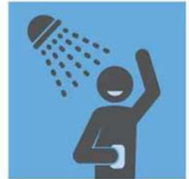
PRACTICE GOOD HYGIENE HABITS

For more information, visit: coronavirus.ohio.gov