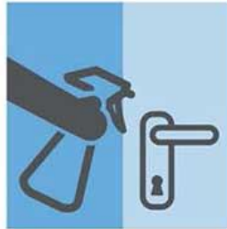
CLEAN AND DISINFECT "HIGH-TOUCH" SURFACES OFTEN