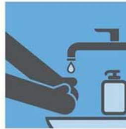
WASH HANDS OFTEN WITH WATER AND SOAP (20 SECONDS OR LONGER)