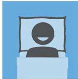
GET ADEQUATE SLEEP AND EAT WELL-BALANCED MEALS