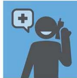
CALL BEFORE VISITING YOUR DOCTOR