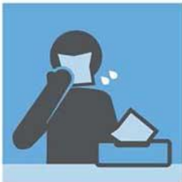
COVER YOUR MOUTH WITH A TISSUE OR SLEEVE WHEN COUGHING OR SNEEZING