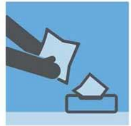
DRY HANDS WITH A CLEAN TOWEL OR AIR DRY YOUR HANDS