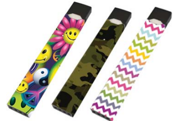
JUUL skins. Images from https://www.mightyskins.com/juul/

According to data from Wells Fargo, JUUL’s popularity has grown dramatically in the last year, with unit sales increasing more than 600 percent in 2017. In mid-2016, dollar sales share for JUUL products was less than 5 percent, the lowest compared to products sold by the main companies in Nielsen-tracked channels. * But by the end of 2017, JUUL sales had surpassed all other companies’ products (see adjacent graph). 3 As a result, JUUL is now more popular than the e-cigarette brands manufactured by the major tobacco companies (blu, Vuse, and MarkTen). According to the most recent data from Wells Fargo, JUUL sales currently represent 64% of the market share. 4