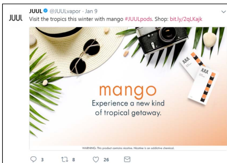
JUUL Twitter Post. January 9, 2018. https://twitter.com/JUULvapor/status/950890455499231235

JUUL devices and JUULpods are available for sale on JUUL’s website and other online retailers as well as in convenience stores, vape shops, and tobacco retailers. To access JUUL’s website, users must indicate that they are 21 or older by simply clicking on a button, but JUUL asserts that it uses stricter age verification processes for online purchases. FDA law prohibits sales of e-cigarettes to those under age 18 and some state and local laws have higher minimum age-of-sale laws. Youth are obtaining JUUL products from social sources who may be over age 18, online or in-person from retailers that are not in compliance with state or federal law, or from online resellers like ebay † and Craigslist that have no age verification. A 2018 study found that among surveyed youth JUUL users (ages 12-17), three-quarters had purchased a JUUL device from a retail store and half had gotten JUUL from a social source. 21 In April 2018, the FDA sent warning letters to 40 retailers across the country for illegally selling JUUL products to minors. 22 Though the up-front cost of the device is high (a JUUL starter kit, which includes the device, charger and 4 JUULpods, is $49.99 on the JUUL website), advocates have shared stories of kids pooling together money to share a device and sell “hits” from the device to recoup the cost.