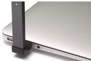
JUUL device charging in the USB port of a laptop.

JUUL Labs produces the JUUL device and JUULpods, which are inserted into the JUUL device. In appearance, the JUUL device looks quite similar to a USB flash drive, and can in fact be charged in the USB port of a computer. According to JUUL Labs, all JUULpods contain flavorings and 0.7mL e-liquid with 5% nicotine by weight, which they claim to be the equivalent amount of nicotine as a pack of cigarettes, or 200 puffs. JUULpods come in five flavors: Cool Mint, Crème Brulee, Fruit Medley, Virginia Tobacco, Mango, as well as three additional limited edition flavors: Cool Cucumber, Classic Tobacco, and Classic Menthol. 1 Other companies manufacture “JUUL-compatible” pods in additional flavors; for example, the website Eonsmoke sells JUUL-compatible pods in Blueberry, Silky Strawberry, Mango, Cool Mint, Watermelon, Tobacco, and Caffé Latte flavors. 2 There are also companies that produce JUUL “wraps” or “skins,” decals that wrap around the JUUL device and allow JUUL users to customize their device with unique colors and patterns (and may be an appealing way for younger users to disguise their device).