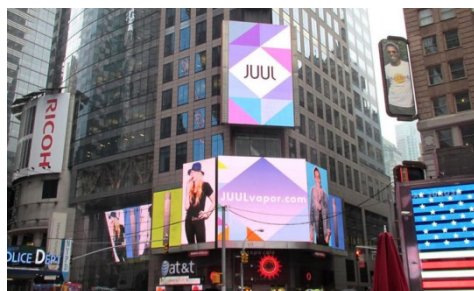
JUUL billboard in Times Square, New York City, 2015.

However, social media continues to help fuel JUUL’s popularity. While JUUL’s Instagram account is age-restricted to those 18 and older, its Twitter account is not age restricted and contains similar content. Additionally, JUUL-sponsored posts and user-generated posts that tag (e.g., #JUULvapor, #doit4JUUL) and feature JUUL have no restrictions. These kind of social media posts can increase exposure to pro-e-cigarette imagery and messaging, by making JUUL use look cool and rebellious. In April 2018, the FDA sent an official request for information to JUUL Labs to obtain more information about the youth appeal of the product, including the company’s marketing practices. 20